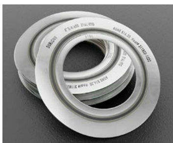
Durlon® ETG Extreme Temperature Gaskets SWG/Durtec®/Kammprofile

Durlon® Spiral Wound Gaskets are made with an alternating combination of a preformed engineered metal strip and a more compressible filler material which creates an excellent seal when compressed. The engineered shape of the metal strip acts as a spring under load, resulting in a very resilient seal under varying conditions. The strip metallurgy and filler material can be selected to seal a wide range of applications. All Class 150 & 300 Durlon® SWG styles have been engineered to precise manufacturing tolerances and utilize optimal winding density that allow for lower stress (bolt load) sealing compared to conventional spiral wound gaskets thus eliminating the need to stock both standard and low stress SWG's.