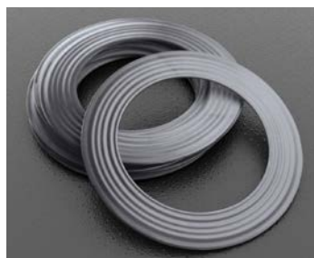
Durlon® Durtec® Specially Engineered Metal Core Technology

The serrated core is covered with soft sealing material and is dependent on the service conditions of the system (flexible graphite and expanded PTFE are most common).