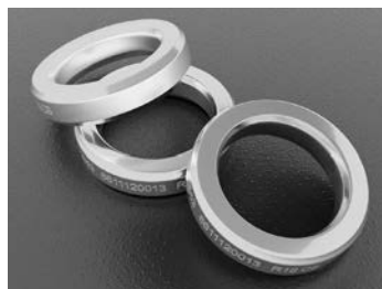
Durlon® RTJ Ring Type Joint Gaskets Styles: R, RX, BX

Durlon® Durtec® gaskets are made with a specially engineered machined metal core that is bonded on both sides with soft covering layers, typically flexible graphite. The core is produced by proprietary technology that allows the finished gasket to have the best possible mechanical support function. The Durtec® core is virtually uncrushable, unlike conventional corrugated metal core gaskets. The precision construction guarantees that Durlon® Durtec® gaskets will have excellent sealing characteristics even under low bolt loads.