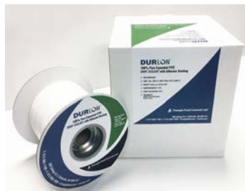
Durlon® Joint Sealant 100% Pure Expanded PTFE Gasket Material

Durlon® Extreme Temperature Gaskets (ETG) have been engineered to provide the preeminent solution to sealing gasketed joints having exposure to high temperatures, typically greater than 650°C (1,200°F) and up to 1,000°C (1,832°F). At extreme temperatures, flange assembly torque retention is the key component to maintaining a tight seal. Durlon® ETG combines an oxidation boundary material with the excellent stability and sealing characteristics of flexible graphite in order to preserve seal integrity and retain the initial assembly torque.